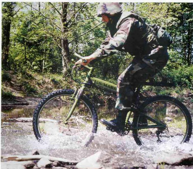
Paratrooper® - your rugged military-grade companion

In 1997, under a grant from US's Defence Advanced Research Projects Agency, Montague Bikes partnered with the US Marines to develop the Tactical No Signature MTB using a new folding bike frame design integrating the F.I.T™ (Folding Integrated Technology) system. The non-electric version, named the Paratrooper®, soon became available thereafter.