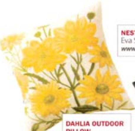
3. DAHLIA OUTDOOR PILLOW Pottery Barn, $48, www.potterybarn.ca