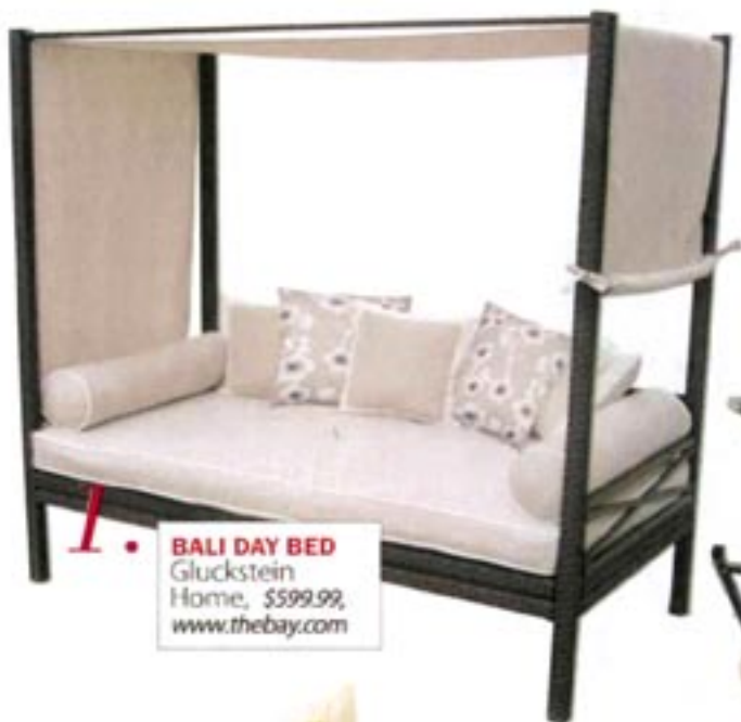
1. BALI DAY BED Gluckstein Home, $599.99, www.thebay.com