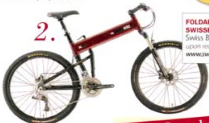
2. FOLDABLE SWISSBIKE TX Swiss Bike, price upon request, www.swissbike.com