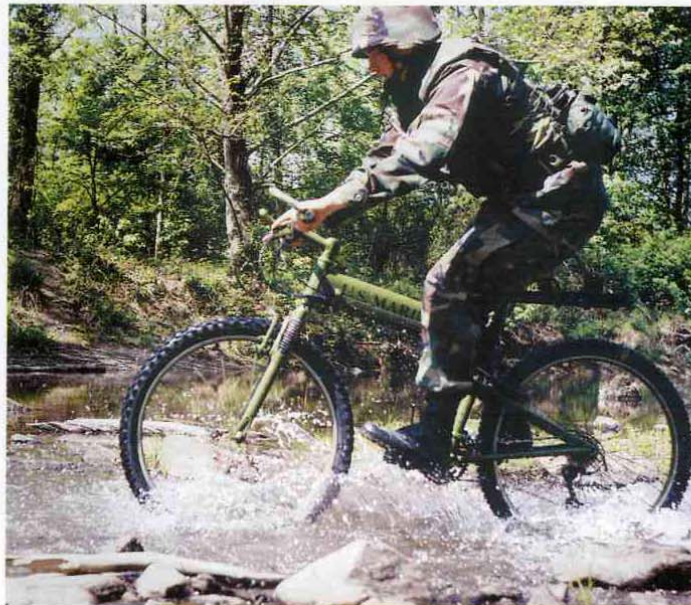
Paratrooper® - your rugged military-grade companion

In 1997, under a grant from US's Defence Advanced Research Projects Agency, Montague Bikes partnered with the US Marines to develop the Tactical No Signature MTB using a new folding bike frame design integrating the F.I.T™ (Folding Integrated Technology) system. The non-electric version, named the Paratrooper®, soon became available thereafter.